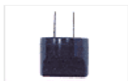
【A Type plug】

In Japan, the voltage is AC100V, with a frequency of 50 hertz in Tokyo, Japan. The power plug in Japan is the flat, two-pin “A Type” plug.