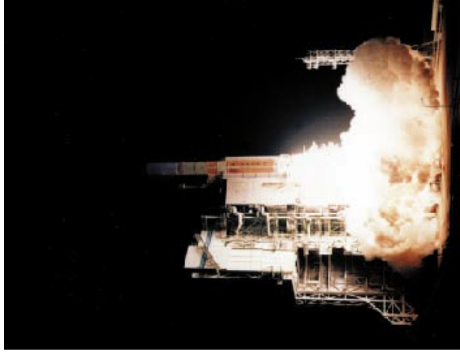
Fig.2 TRMM lifts off on board H- II Launch Vehicle No.6