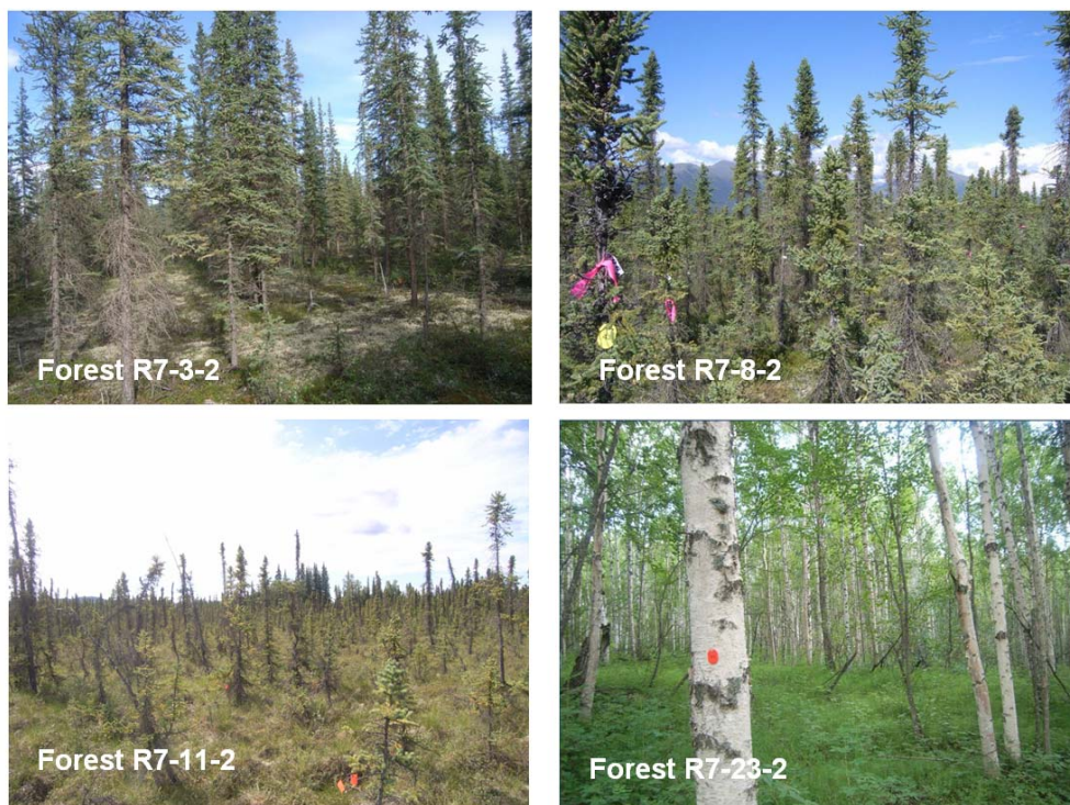
Fig. 2. Pictures of typical forests in Alaska. Sparse white spruce forest (top-left), sparse and low black spruce forest, (bottom-left), dense and low black spruce forest (top-right), high birch forest (bottom-right).

Table 1 shows the biomass of 29 forests estimated by BACS-STM method. The forest biomass that had the smallest biomass values among the forests targeted were 2.2 ton/ha. The forest was very sparse white spruce forest and most of the tree height were below 10 m. On the