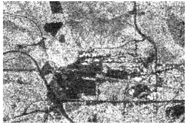
Fig. 3. Sample image of ALOS/PALSAR around Fairbanks, Alaska.